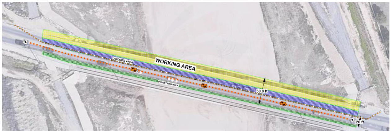
Phase 3: Current Temporary Traffic Lanes at South

of the bridge so that work may be completed on the center of the bridge. The illustrations below show the traffic patterns during each phase.