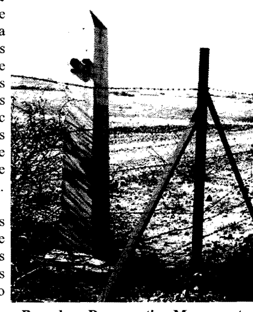
Boundary Demarcation Monument

The USIBWC maintains a second Arizona office in Yuma, which works primarily on issues related to the Colorado River.