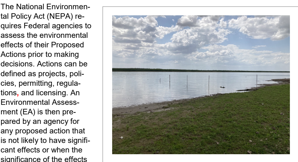
Falcon Reservoir, Zapata County, Texas

ate the impacts on the human and natural environment of land management and grazing leases at the Falcon Project in Starr and Zapata Counties, Texas.